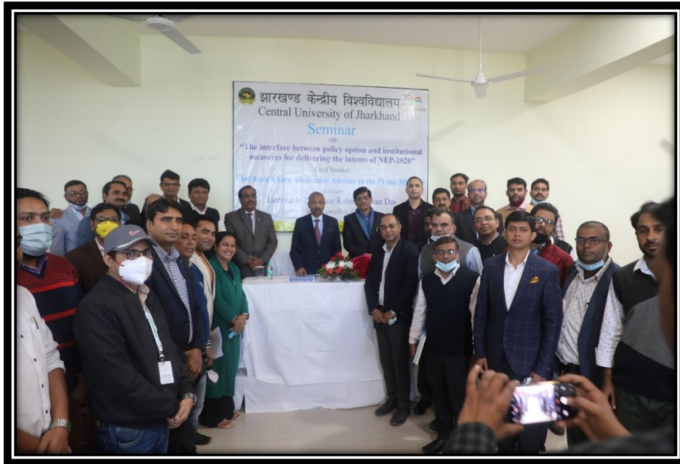
A post session group photograph