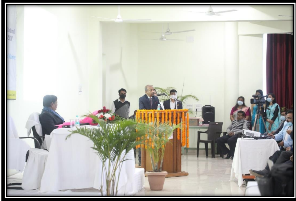
Hon'ble Shri Amit Khare delivering the key-note address.