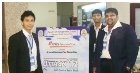
Management Students with Prize at All India Open Competition in BHU

got admissions in top institutions like TIFR (PG in Maths) Bangalore, Delhi School of Economics, IIT Delhi, XLRI Jamshedpur, Pondicherry University and Hyderabad University . A documentary by the students of Mass Communication was awarded Special Critics Award by the Jury in the 1 st Delhi Shorts International Film Festival 2012 ; another was shortlisted in the 5 th Jaipur International Film Festival ; another was