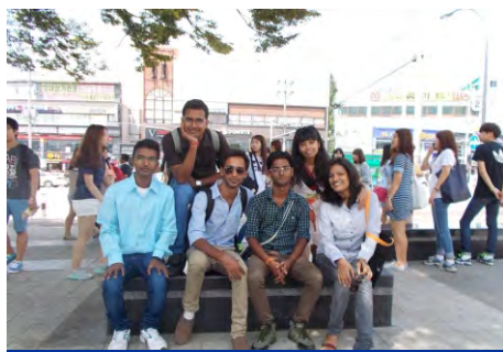
CUJ students at Yeungnam University, South Korea

World Yoga Championship at Malaysia (- she was engaged by a Chinese Company during the summer vacation to teach Yoga in China for a month (2013), an appointment for regular post awaits her after her completing the third year next summer); One student of the Centre for English was selected to represent India in Korea to spend a month in that country (2013); One of our students from Indigenous Culture was awarded full scholarship for a six month tenure at Yeungnam University, South Korea