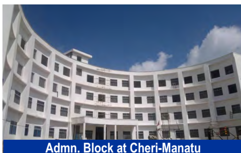
Admn. Block at Cheri-Manatu

The present campus of the University is located at Brambe, a 25 km drive away from Ranchi city, in the State of Jharkhand, India. It is a beautiful and vibrant green campus, with classrooms and hostels blending well with the environment. The classroom complex is located inside a mango orchard and the hostels are surrounded by tall sal trees. In order to preserve the trees, one can find some inside the rooms and growing through the roofs. With the State Government of Jharkhand allotting land for its permanent campus at Cheri-Manatu, about 10 kms off Ranchi city, construction work has started with a plan to create a campus worth visiting and staying in.