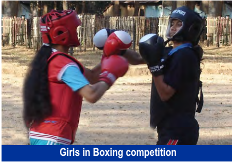
Girls in Boxing competition