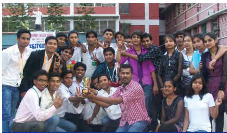
Students with trophy winning in Management Festival

awarded the Best Student Video in the All Bihar Video Film Festival ; juniors received First Prize in Collage Making at the Ranchi Film Festival organized by DFF, Min of I&B. One of our Mass Comm students was selected for a three-month internship with the Press Division at the Rastrapati Bhavan (owing to his good performance he has been given an extension of another term); One student from the Centre for Life Sciences was selected for the