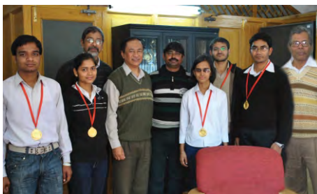
Gold medal winners at Honours Olympiad (Math)

Our students continue to make us proud with their positive contribution in academics and extracurricular activities. Our students of Applied Mathematics have been consistently (2011, 2012) winning the team Gold Medal in the Honours Olympiad organized by the Chhotanagpur Mathematical Society. At the National Seminar 2013 on “Transformational Leadership” organised by Sri Ram College of Commerce, Delhi University , our Management students bagged the first prize . Another team of CUJ stood 4 th in the Case Study competition. In 2012 UTTHAAN all India B School Competition organized by BHU, CUJ Management students came fourth , with two teams qualifying for the finals. With an exit option after the third year the few who did leave