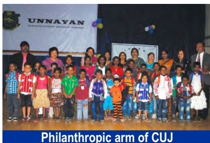
Philanthropic arm of CUJ