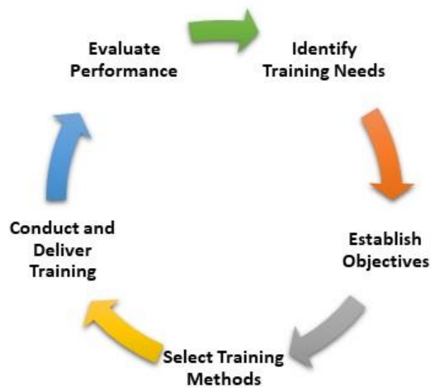
Figure: Overlook of the Process of T & D (mbaskool, 2011-19)

It's a continuous process because for a call for continuous up gradation of knowledge, skill and Quality of work. Changing business scenarios across globe & sectors and technological revolutions like Cloud computing, Artificial Intelligence coming in, companies need to focus of their employees training and development activities and chart.